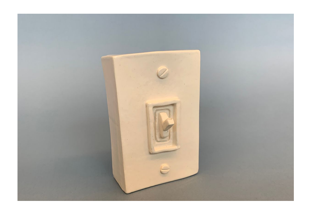
Stacy Antoville Light Switch #2 2019 Ceramic sculpture 4 x 2.5 x 1 in