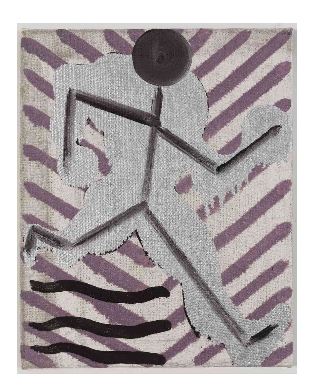
Joshua Abelow Running Man 2013 Oil on burlap 20 x 16 in