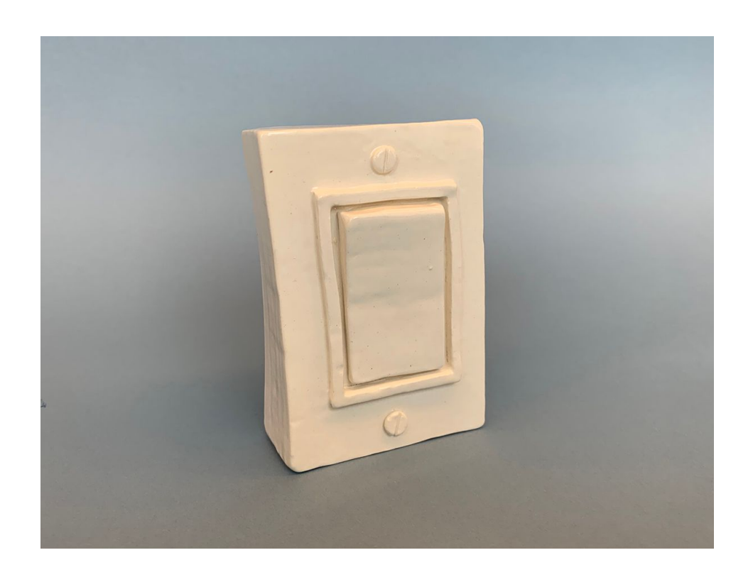
Stacy Antoville Light Switch #1 2019 Ceramic sculpture 4.5 x 3 x 1 in